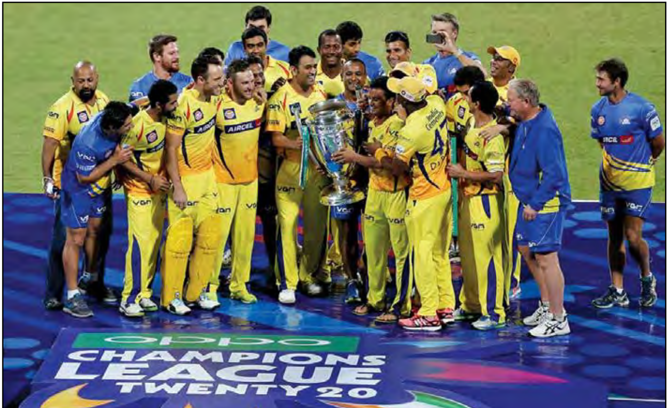
CHENNAI SUPER KINGS ARE CHAMPIONS OF CHAMPIONS