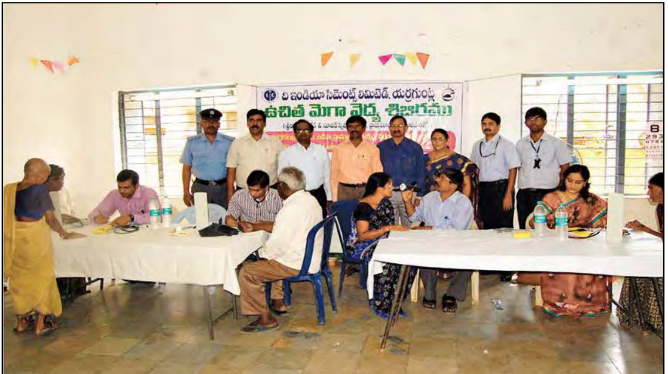
MEGA MEDICAL CAMP AT YERRAGUNTLA FOR GENERAL PUBLIC