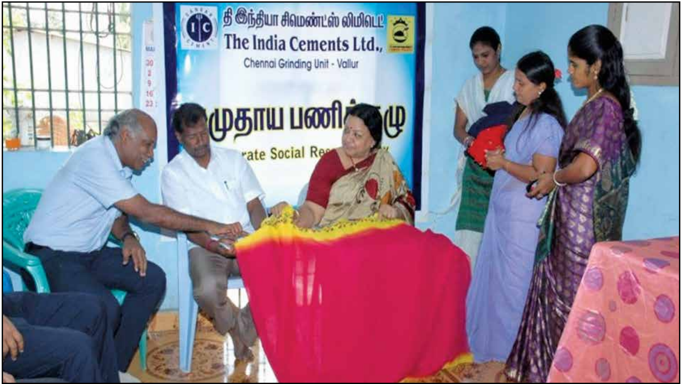
ADVANCED TRAINING IN EMBROIDERY FOR LOCAL WOMEN AT CHENNAI GRINDING UNIT